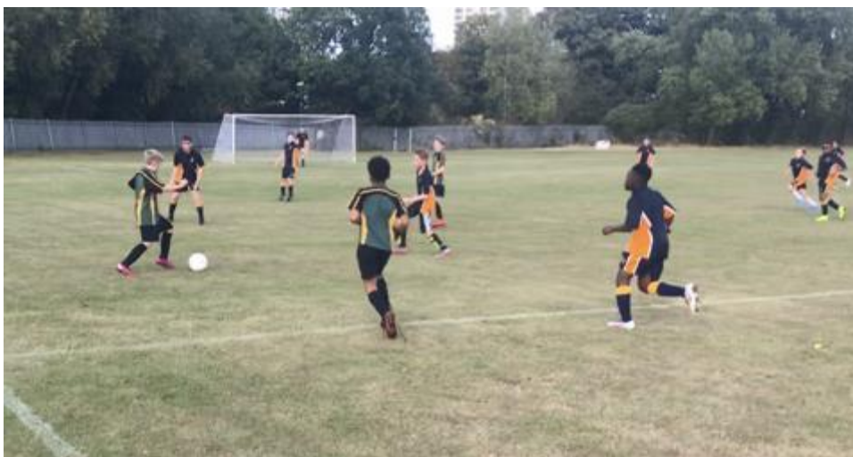
Under 12 footballers in action during their first match of the season

If you have questions with regards to individual clubs please ask your child(ren) to speak directly to the member of staff leading the club.